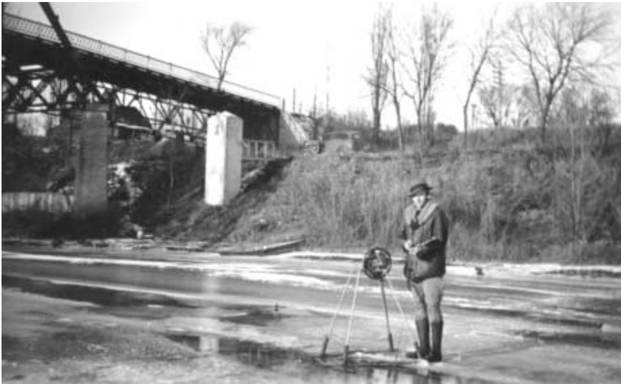
Ice measurement of flow, Mississippi River at Elk River, 1933.